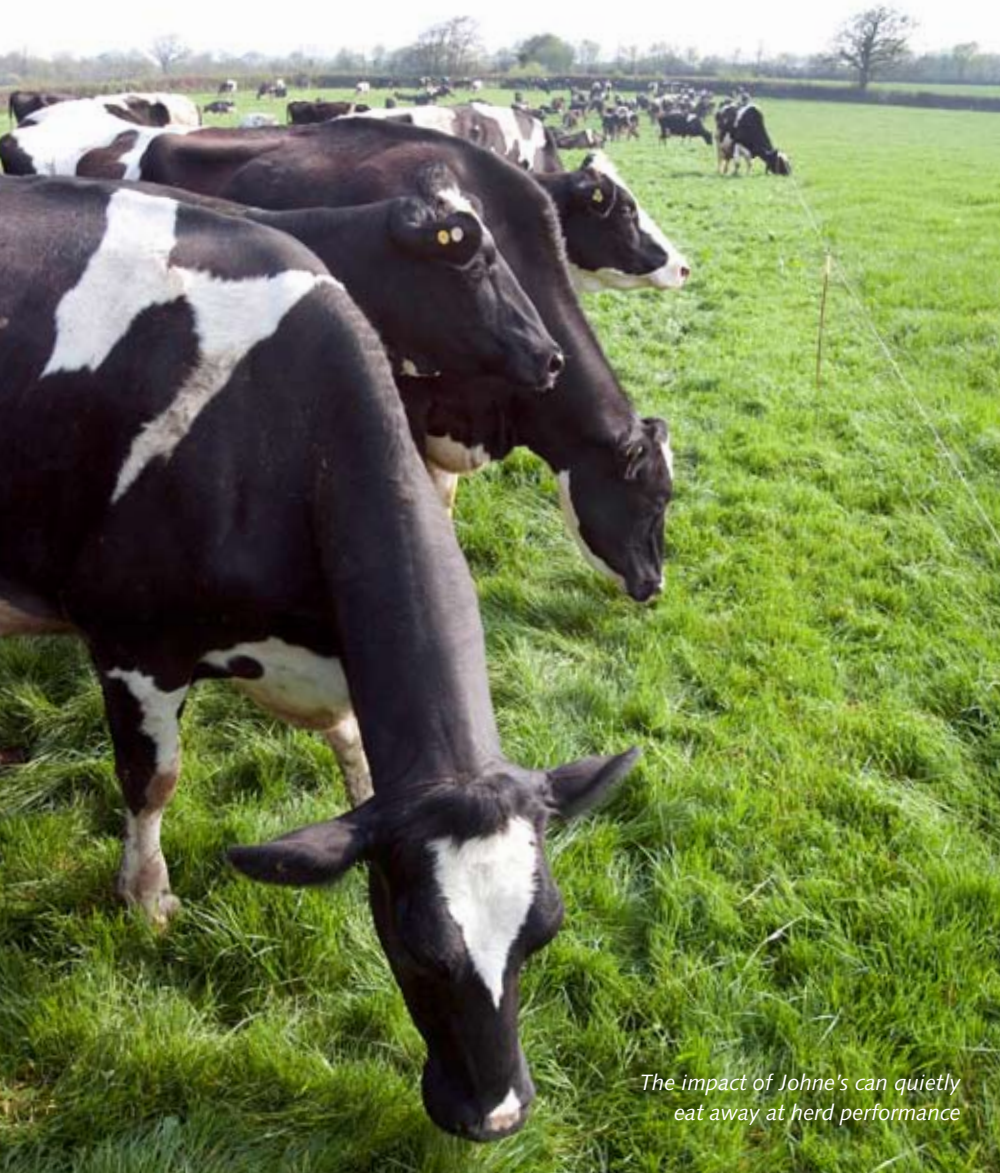
The impact of Johne's can quietly eat away at herd performance

He points out that this data is just a snapshot. "It's a preliminary study, but I believe that it is indicative of the