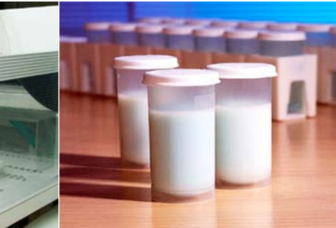
NML disease testing (L) and disease testing using milk samples: a hassle-free service for the producer