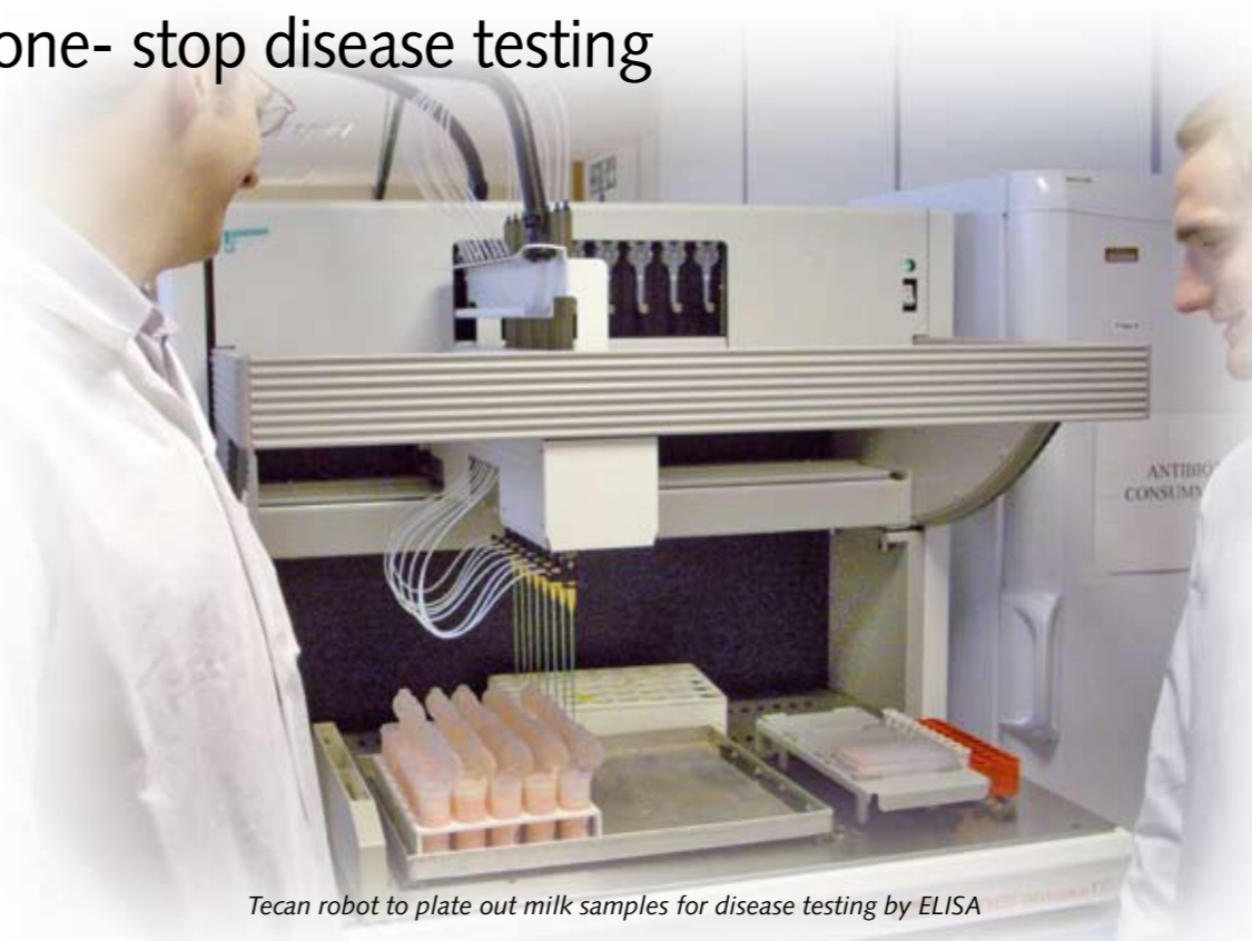
Tecan robot to plate out milk samples for disease testing by ELISA