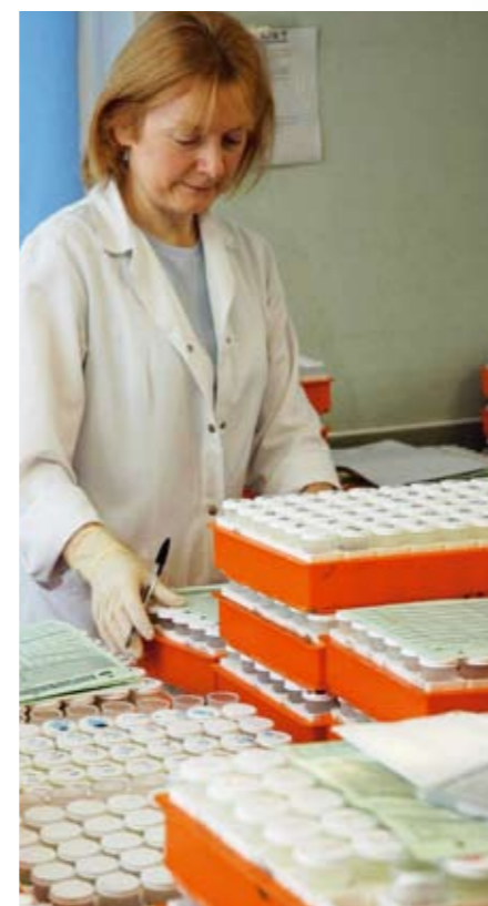
Orange boxes from NMR (above) and bulk milk samples from NML (below): Samples from both sources can be used for disease testing

includes a bulk test for IBR, BVD, Lepto and Johne's, every three months and this costs £19 a quarter – or £76 in total for a year. For an average 200-cow herd that's just 36p a cow. If you consider the cost of a possible disease outbreak it pays for itself, hands down." NML offers a range of options. Although